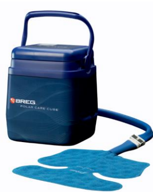
BREG® POLAR CARE CUBE™

Patients are not required to purchase any of these devices. They are only offered as a supplemental modality to help with pain control. Patients may use ice packs from home or any other cold therapy device.