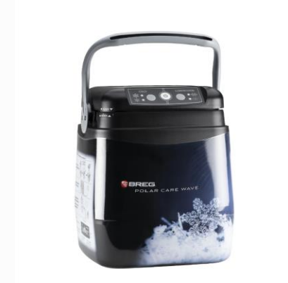
BREG® POLAR CARE WAVE