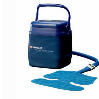
BREG® POLAR CARE CUBE™

Patients are not required to purchase any of these devices. They are only offered as a supplemental modality to help with pain control. Patients may use ice packs from home or any other cold therapy device.