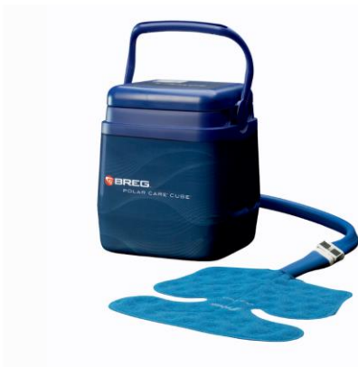
BREG® POLAR CARE CUBE™

Patients are not required to purchase any of these devices. They are only offered as a supplemental modality to help with pain control. Patients may use ice packs from home or any other cold therapy device.