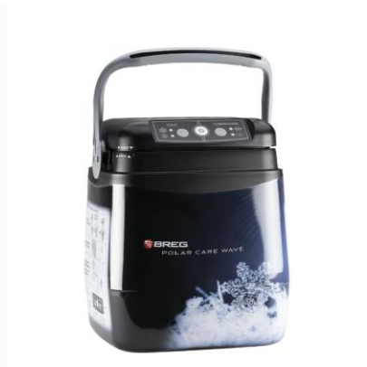
BREG® POLAR CARE WAVE