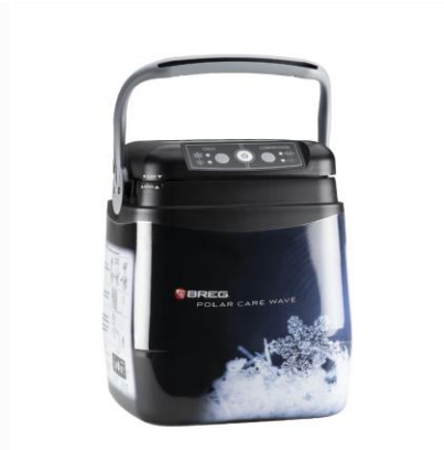
BREG® POLAR CARE WAVE