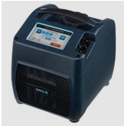
NICE1 COLD + COMPRESSION THERAPY