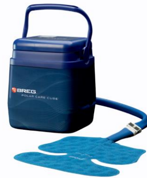
BREG® POLAR CARE CUBE™

Patients are not required to purchase any of these devices. They are only offered as a supplemental modality to help with pain control. Patients may use ice packs from home or any other cold therapy device.