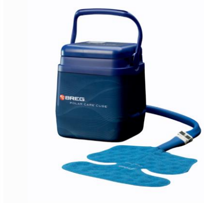
BREG® POLAR CARE CUBE™

Patients are not required to purchase any of these devices. They are only offered as a supplemental modality to help with pain control. Patients may use ice packs from home or any other cold therapy device.