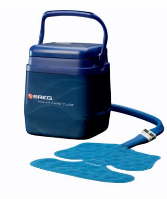
BREG® POLAR CARE CUBE™

Patients are not required to purchase any of these devices. They are only offered as a supplemental modality to help with pain control. Patients may use ice packs from home or any other cold therapy device.