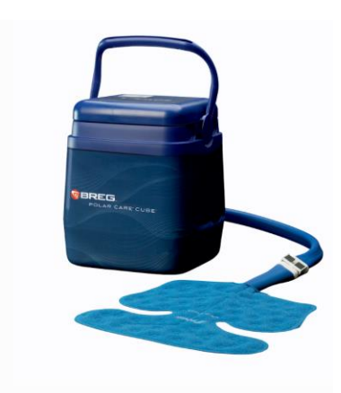
BREG® POLAR CARE CUBE™

Patients are not required to purchase any of these devices. They are only offered as a supplemental modality to help with pain control. Patients may use ice packs from home or any other cold therapy device.