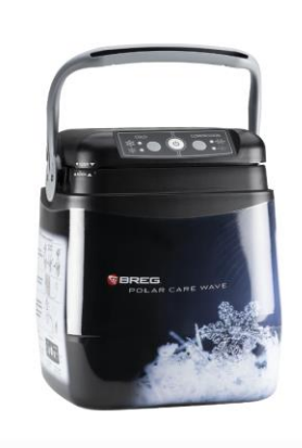
RDEG® POLAP CADE WAVE